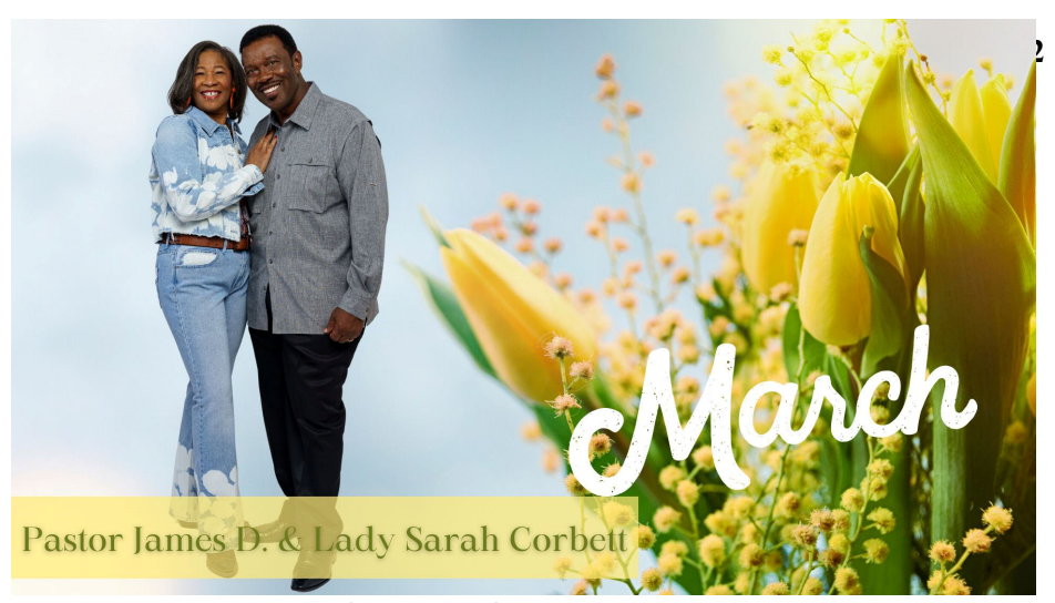
Greetings in the Wonderful Name of Jesus!

The grace of our Lord Jesus Christ be with you. It brings joy to my heart to share with you the abundant blessings and mighty moves of God within our beloved Greenville Community Christian Church. Truly, the hand of the Lord is upon us, as souls are being saved and our congregation is experiencing unprecedented growth.